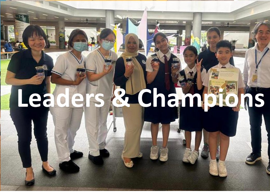
Leaders & Champions